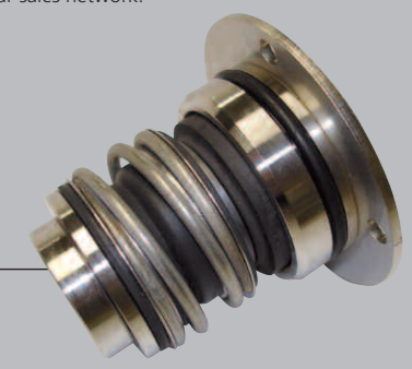
EVM 32-45-64 versions are fitted with a mechanical cartridge seal

Standard motors for ambient temperatures up to 40°C and altitudes of 1,000 m. For different applications, kindly contact our sales network.